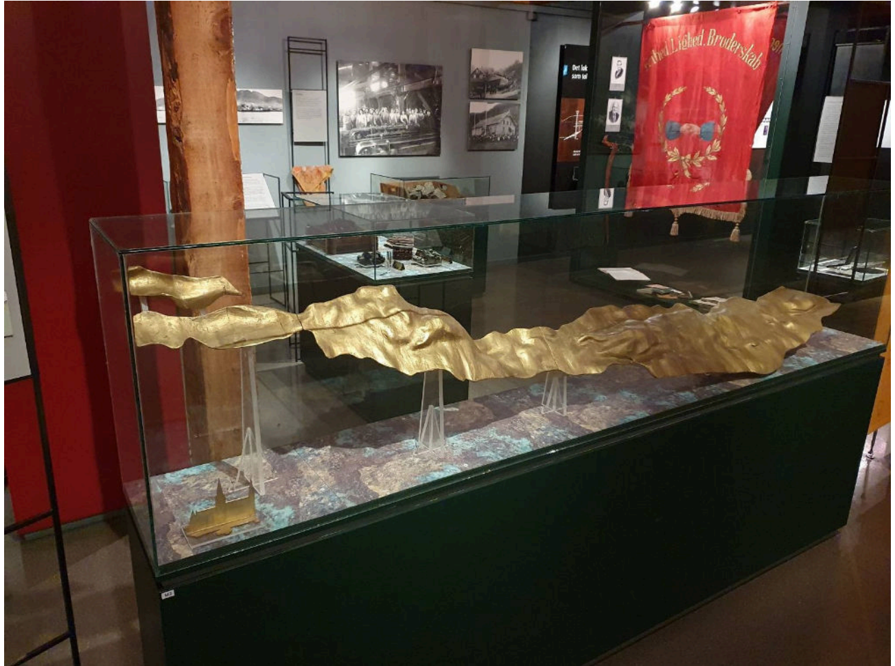
Picture 1: 3D model of Lokken (looking from East - the shallowest part - to the West - the deepest part)